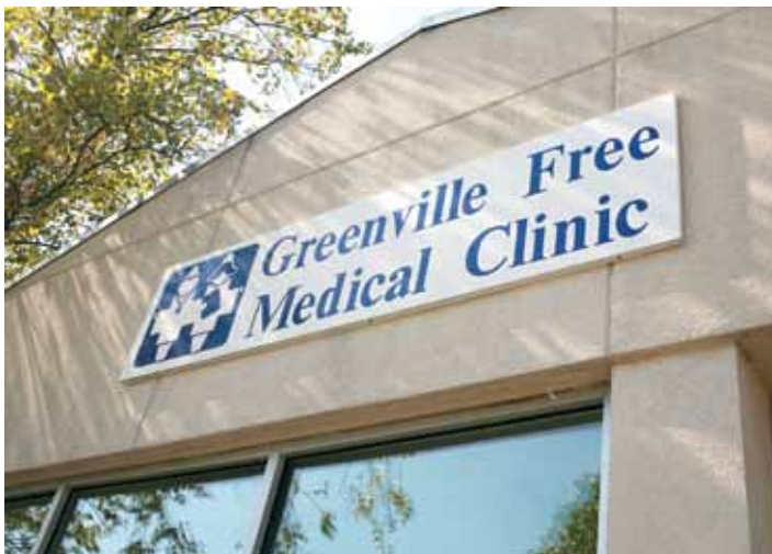
Greenville Free Medical Clinic.

The Greenville Free Medical Clinic provides free outpatient health services, including primary care, dental services, health education, and prescriptions to the medically underserved and uninsured.