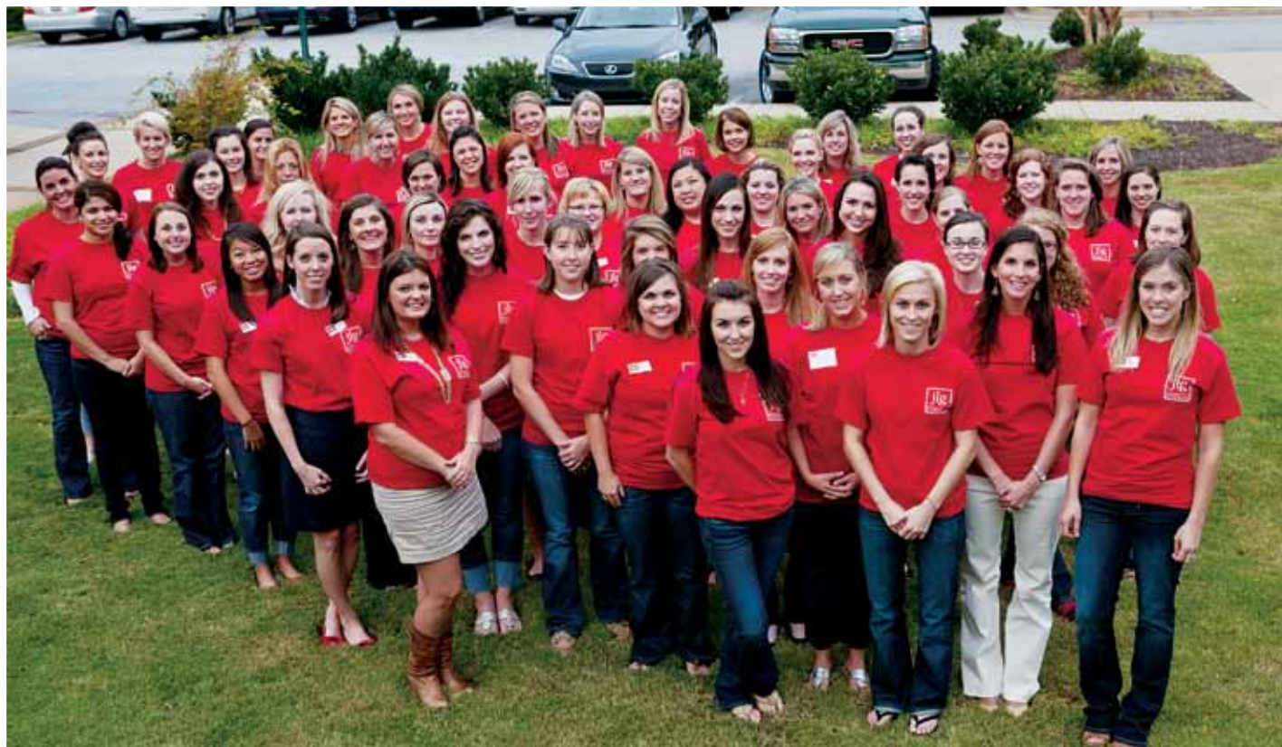
The Junior League of Greenville Provisional Class 2011-2012.

118 Greenacre Road, Greenville, SC 29607 www.jlgrvill.org | 864.233.2663