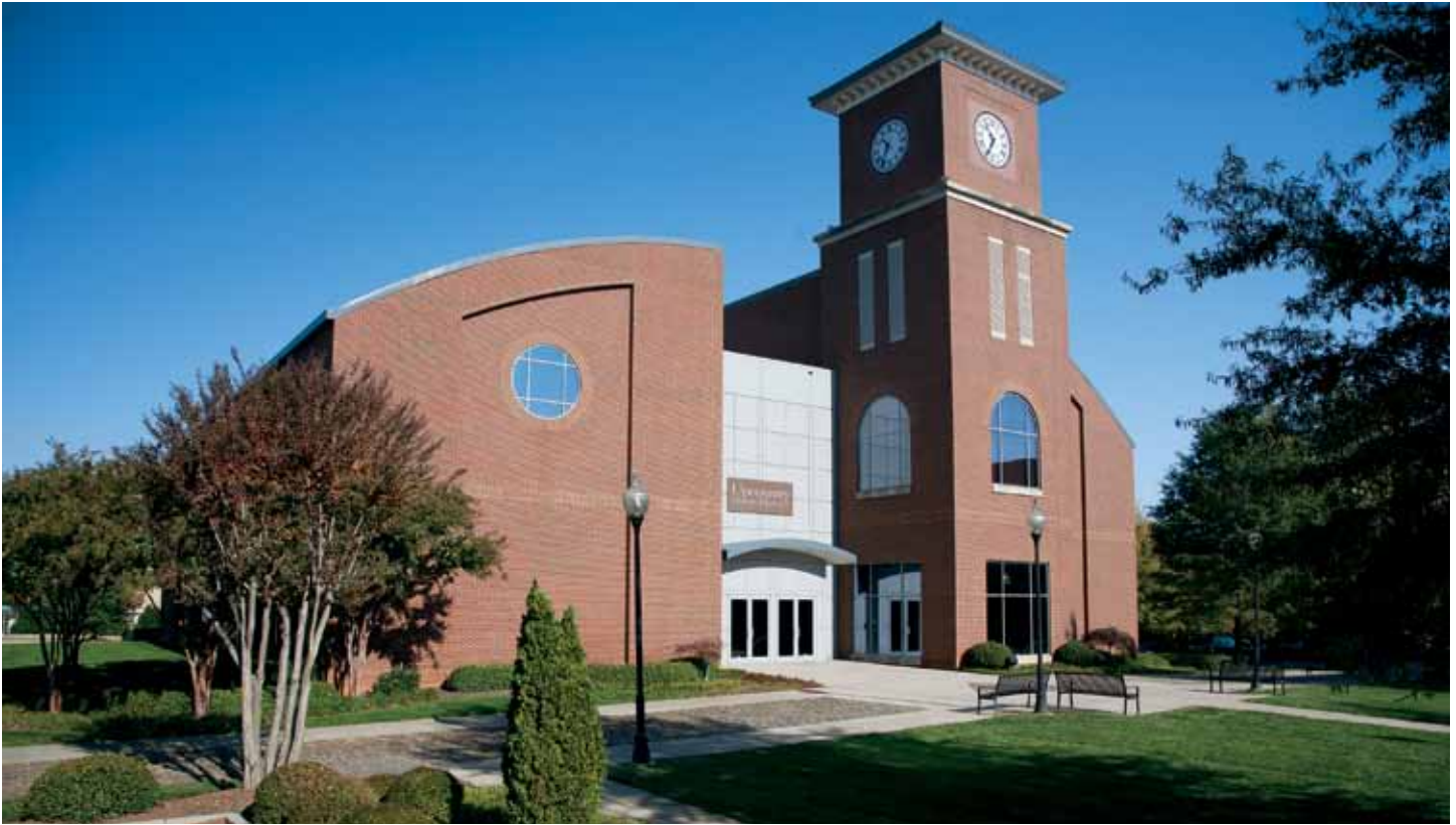
Upcountry History Museum.