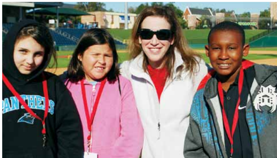
Home Run for Healthy Kids.

One day last week, I had what is best described as a “breakdown” kind of day. My 4-month-old was running a fever due to the vaccines she received at her well check the day before, and my 6-year-old was covered from head to toe in poison ivy from the woods that separate our backyard from a city park. I also had a room mom meeting and a PTA meeting at my son’s school, there was an epic homework tantrum at my house, and I was struggling with meeting ad and content deadlines for this magazine.