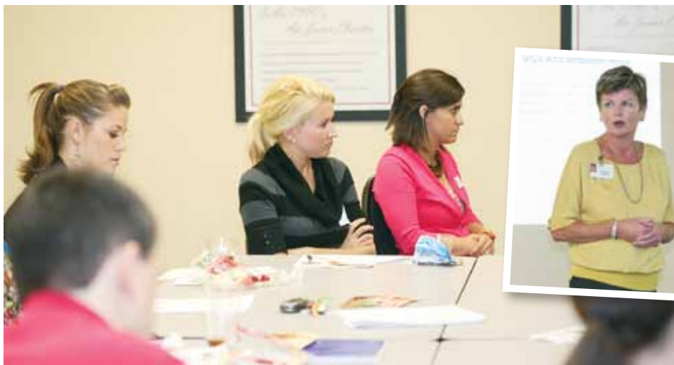
Junior League Members attend an informational seminar.