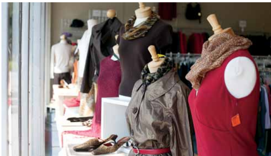
Nearly New Shop merchandise.

There are over 1500 customer transactions each month. In 2010-2011 the League was able to raise $150,000 through the Nearly New Shop after expenses were paid.