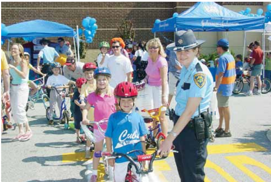
Photos from this year's Safe Kids events.