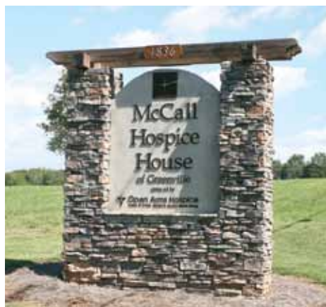
McCall Hospice House.

No community is complete without all of the pieces holding firm to their place. From the top to the bottom of a structural building, each piece is important. Our community is no different. Greenville is great because of each arm being wrapped around it, holding it together and lifting to higher and higher places. In fact, Greenville is becoming the poster child for being one of the best cities to call home in the whole big wide country because of community efforts in building it strong. That is amazing. It isn't simply because of the parks that are pretty or that big suspension bridge that we all enjoy feeling a little bit queazy on. It's because of organizations like this one who do their part in giving