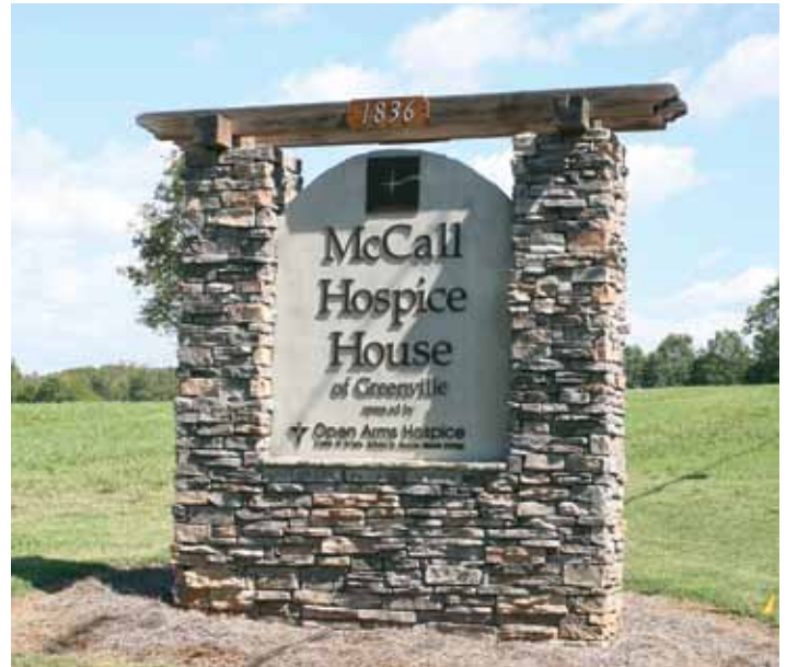
McCall Hospice House.

In 2005, the Greenville Hospital System and Bon Secours St. Francis Health System identified the growing community need for end of life hospice care. The Greenville Hospital System gifted its hospice program to St. Francis and together they are known as Open Arms Hospice. Open Arms Hospice operates the McCall Hospice House, a new 30 bed residential hospice facility