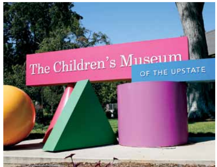
The Children's Museum of the Upstate.

The First Tee's Mission is to impact the lives of young people by providing educational programs that build character, instill life-enhancing values and promote healthy choices through the game of golf. The First Tee has established Nine Core Values that represent positive values connected with the game of golf and are the foundation of the First Tee of Greenville's programming. These Nine Core Values are Honesty, Integrity, Sportsmanship, Judgment, Respect, Confidence, Responsibility, Perseverance and Courtesy.